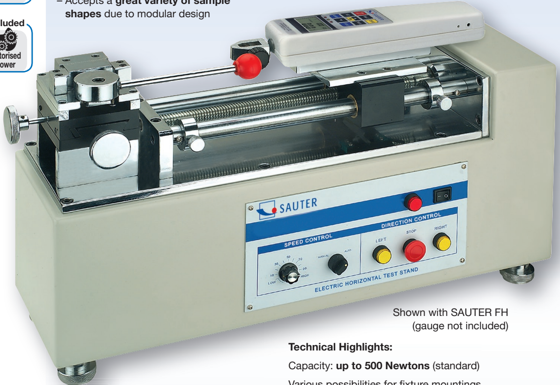
Shown with SAUTER FH (gauge not included)